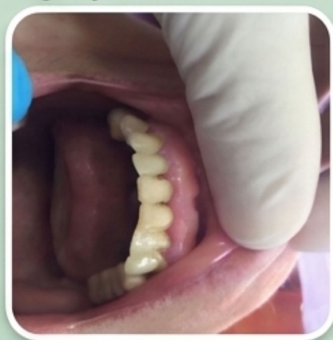
4 Days Post-Surgery