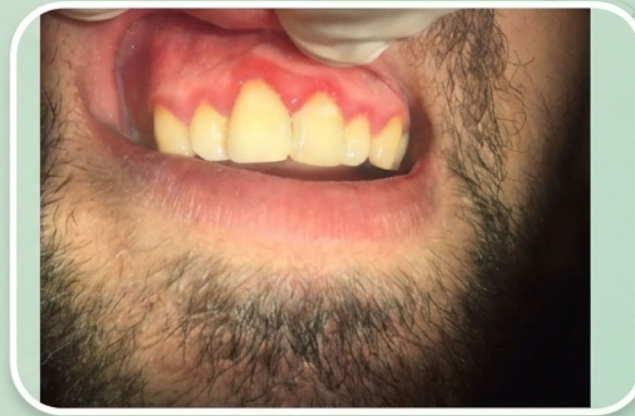
24 Hours After Support