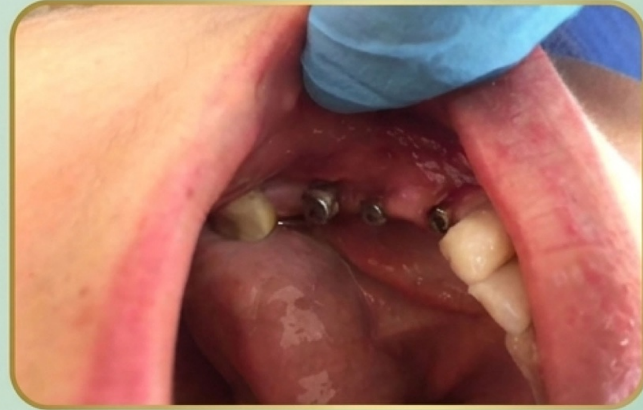
After 8 Days