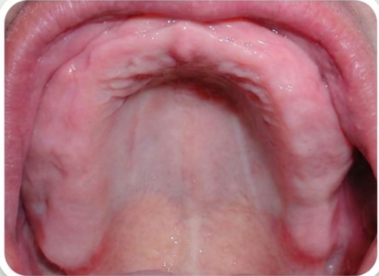
Day 6 post-extraction